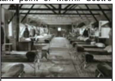
Dormitory-style barracks at Tuna Canyon

governance was that he stressed to the guards that the detainees were not prisoners because they were criminals they were prisoners because there was a war going on between two countries. The guards were to treat the detainees with respect.