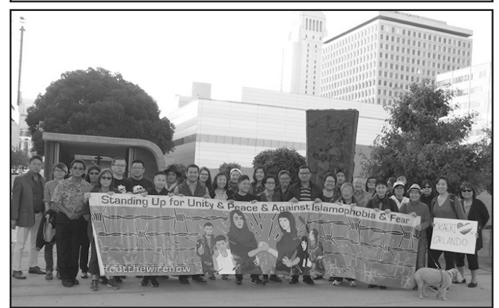
Asian Americans assemble before the LGBQT vigil in downtown Los Angeles.